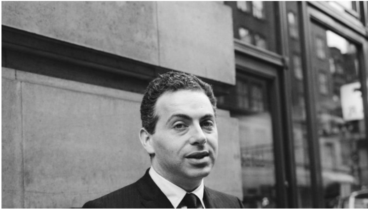
Jackie Mason in his prime

Jackie Mason, the last of the Borscht Belt comedians, died last month in New York, at 93. Renowned for his trademark rasping New York accent and his penchant for saying the unsayable, Mason's comedy sprang, he always said, from his first career — as Rabbi Yacov Moshe Maza, following in the footsteps of his great-grandfather, grandfather, father and three older brothers.